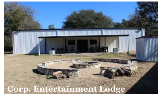
Corp. Entertainment Lodge