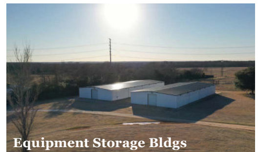
Equipment Storage Bldgs